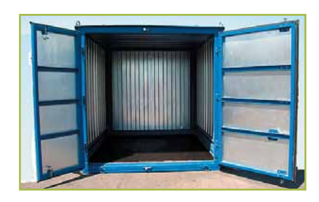
Double Steel Doors & Moisture-Resistant Composition Floor