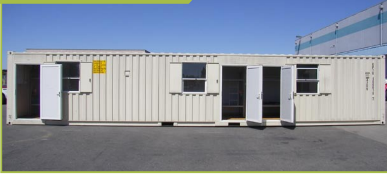
Six Person Bunk House 8' x 40'

Our 3-room, 2-bath Bunk House comfortably sleeps 6 adults and is fully furnished with bunk beds, desks, chairs, lamps and steel lockers. 2 well-lit privacy bathrooms offer toilets, showers and sinks -- plumbed and ready for use. Solid security doors, with locks, provide entry/exit at 3 convenience points. Completely wired with a 110/220 volt electrical system, The Bunk House is powered for light fixtures, wall receptacles, phone/internet hookup. Easily add A/C to any of the 3 sets of swing out enclosures, or just open any of the quality glass windows. Other features include 2" rigid insulated finished walls and ceiling, finished linoleum/vinyl floor and much more!