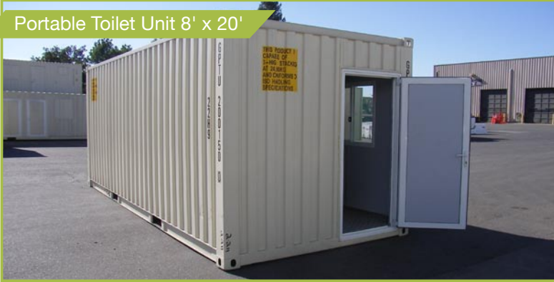
Portable Toilet Unit 8' x 20'

This is a portable toilet/sink unit. Standard features include 6 toilet stalls with private doors, 4 sinks, mirrors above sinks, entrance door, two windows, finished walls and ceiling, aluminum floor, AC exhaust fans, AC electrical, plumbing and drain lines for toilets and sinks for quick, convenient hook up. Rugged and durable, this building is ideal for any situation where toilet facilities are needed, either for permanent or temporary usage. This unit is manufactured from a new, ISO standard steel container and can be quickly transported via standard cargo container ships, trucks or rail. This building requires no foundation, no structural assembly and carries a 10 year structural warranty. It also offers great resistance to natural disasters. Delivery of this model is available to all destinations in the USA and Canada.