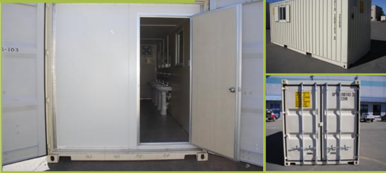
Portable Shower Unit 8' x 20'

This is a portable shower/sink unit. Standard features include 6 shower stalls with private shower curtains, 4 sinks, mirrors above sinks, double lockable exterior doors with single interior entrance door, window, finished walls and ceiling, aluminum floor, AC exhaust fan, AC electrical, plumbing and drain lines for showers and sinks for quick, convenient hook up. Rugged and durable, this building is ideal for any situation where shower facilities are needed, either for permanent or temporary usage. This unit is manufactured from a new, ISO standard steel container and can be quickly transported via standard cargo container ships, trucks or rail. This building requires no foundation, no structural assembly and carries a 10 year structural warranty. It also offers great resistance to natural disasters. Delivery of this model is available to all destinations in the USA and Canada.